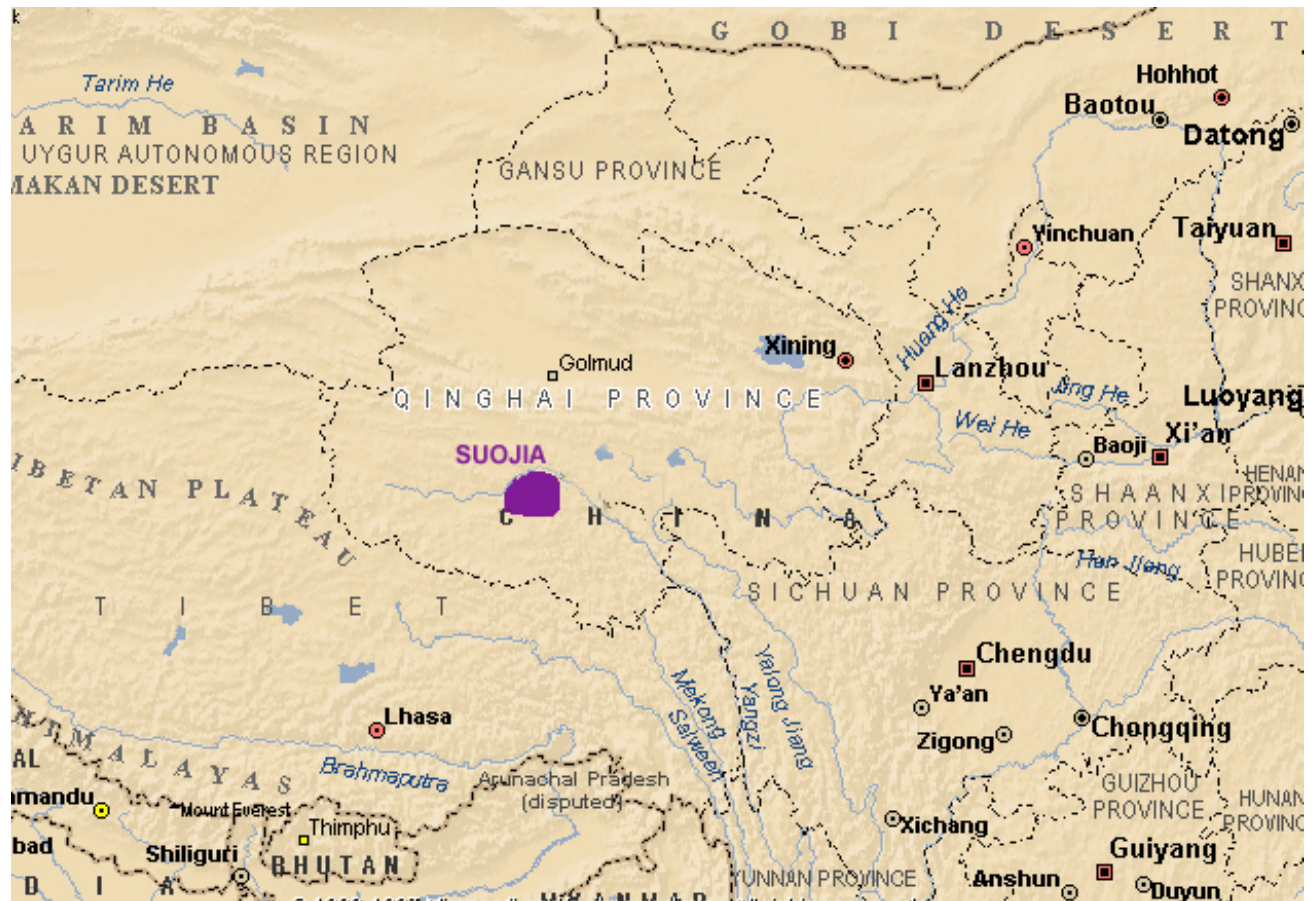
Figure 1: Location of Suojia